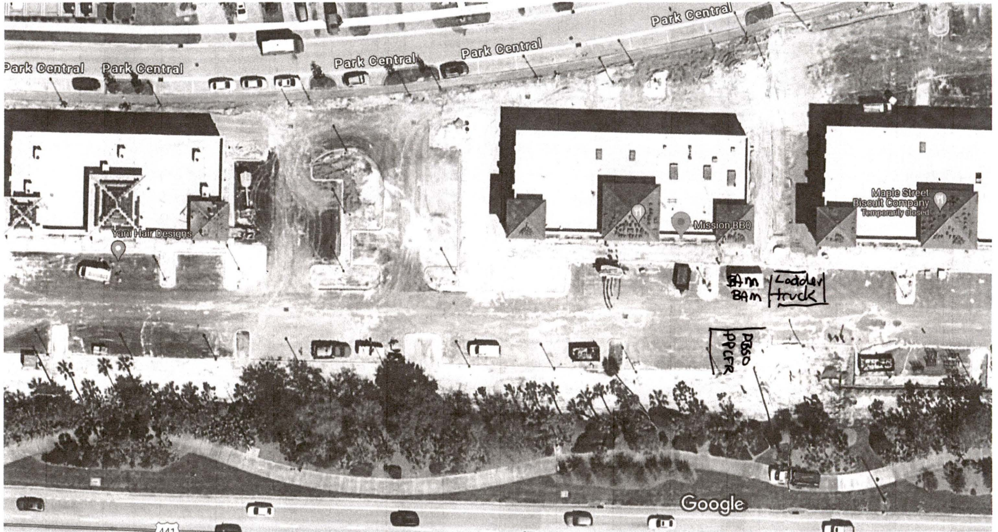
50 ft