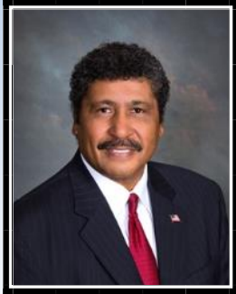
Mayor Fred Pinto