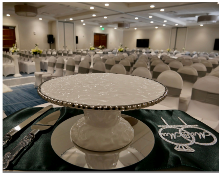
Full Banquet Room