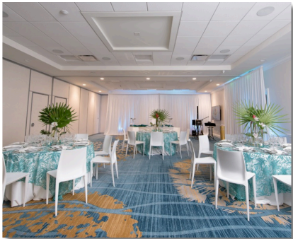
HALF BANQUET ROOM