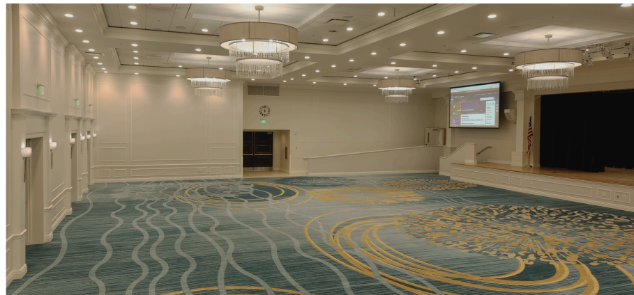
Grand Ballroom (4,500 sq. ft. auditorium with stage)

can accommodate up to 295 people (banquet style) and 600 (theater style) Perfect for a larger wedding or event, the Grand Ballroom allows space for additional amenities available for reservation including, but not limited to, a portable dance floor, dressing room, podium, theatrical stage lighting and buffet style tables.